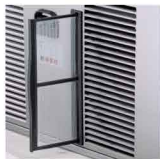
Proximity condenser air filter (AS version only)