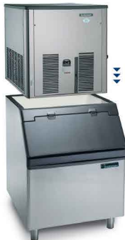
MC 16 "SHORT" with B 393 (sold separately)