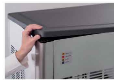
ABS plastic cover